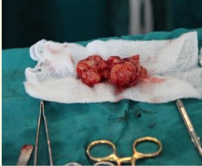
Tuberculoma resected from the brain of the patient in